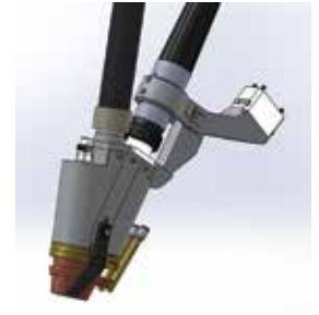
Heavy Duty (HD)