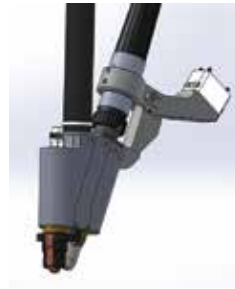
HD Slim (HDS)